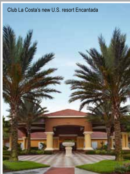
Club La Costa's new U.S. resort Encantada