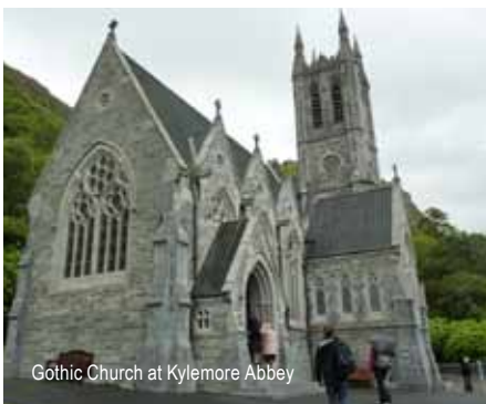
Gothic Church at Kylemore Abbey

Our next stop was Aillwee Cave itself and this was well worth a visit. An interesting guide took us a good walk through the longest cave in Ireland open to the public. After our 40-minute tour it was off to the tea room to indulge in another scone and cup of tea. On leaving the cave we drove via