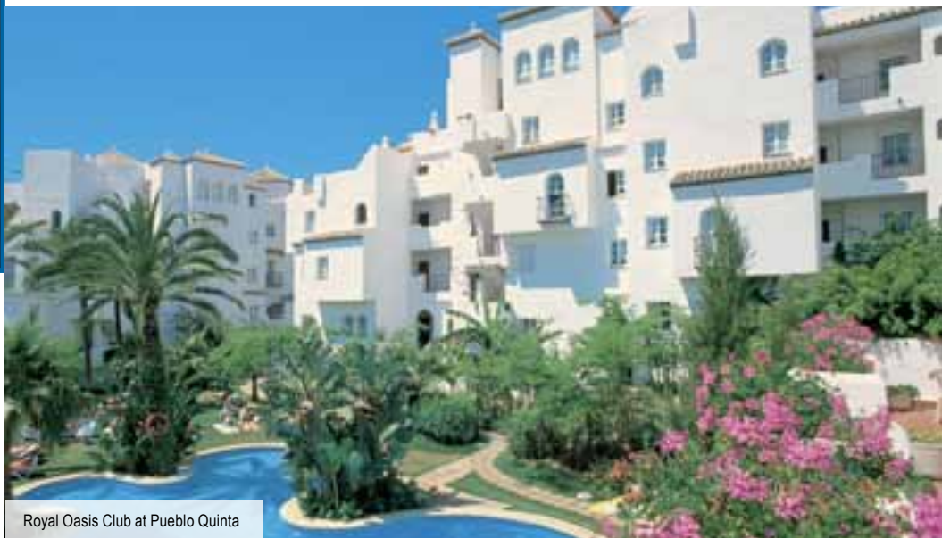
Royal Oasis Club at Pueblo Quinta

“ We have a rolling refurbishment and up-dating programme in place to ensure the resort is kept modern and the RCI Gold Crown rating is maintained. ”